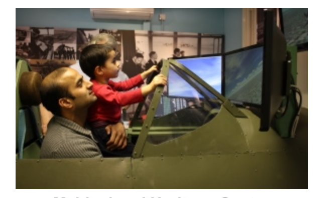
Maidenhead Heritage Centre

Or if you're staying outside Windsor there are two scheduled services allowing you to cruise to this historic town in style. With regular sailings from Maidenhead and Runnymede, you can enjoy a cruise to Windsor in the morning with the option to catch the return service in the afternoon.