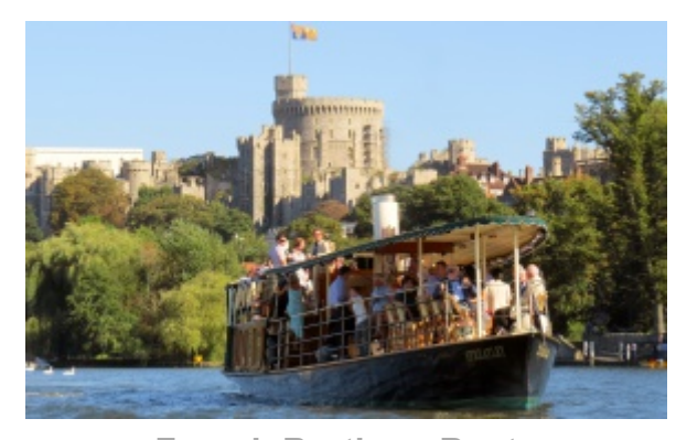
French Brothers Boats

Discover Windsor from a different perspective on a French Brothers River Thames cruise. Choose either a short 40-minute round trip or a longer 2-hour return; both offer amazing views of the Castle.