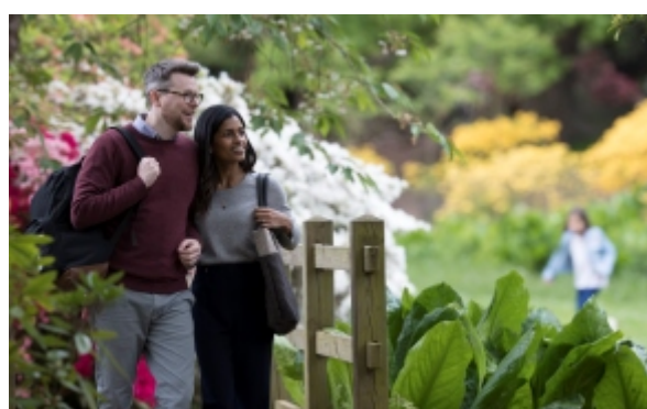
The Savill Garden

One of Britain's greatest ornamental gardens, The Savill Garden never fails to charm visitors who come to explore its 35 acres of contemporary and classically designed gardens and exotic woodland.