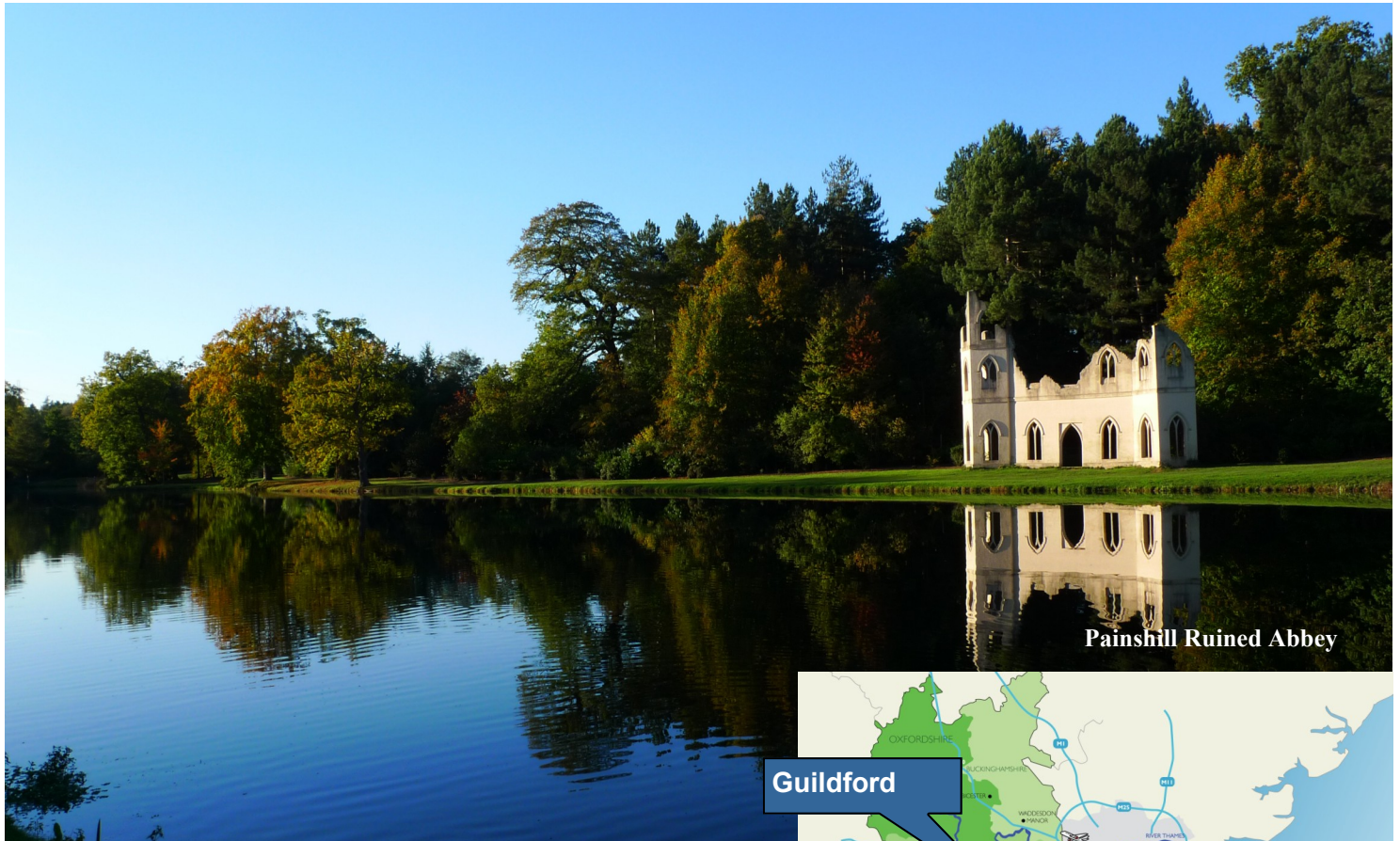
Painshill Ruined Abbey