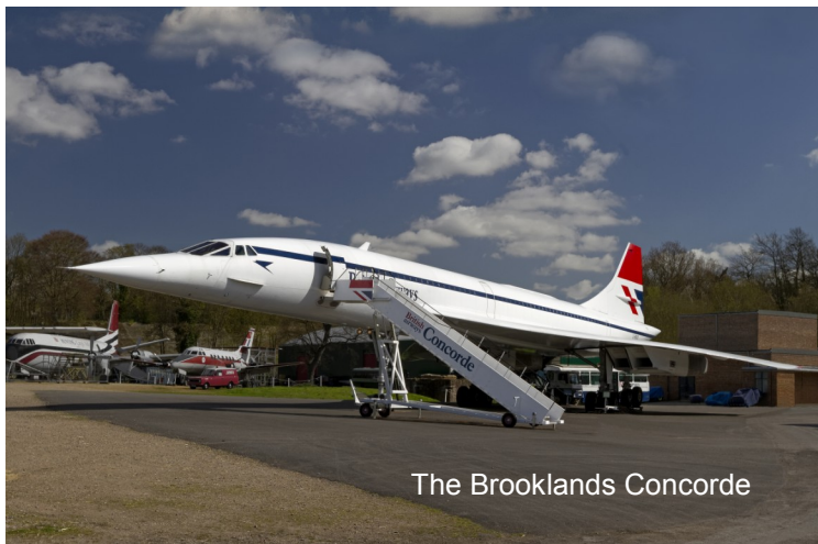
The Brooklands Concorde