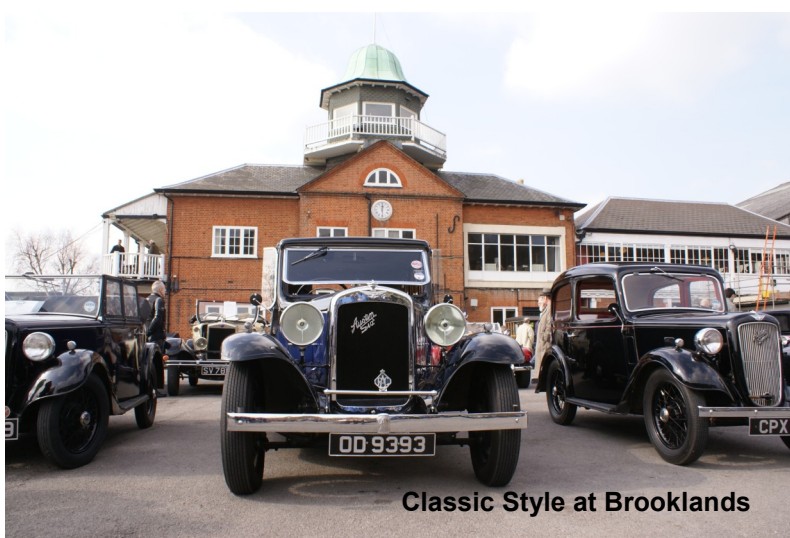
Classic Style at Brooklands

Guildford Town has excellent rail links to Central London (35 minutes) and Portsmouth (55 minutes) as well as a direct rail link to Gatwick Airport. Trains from Guildford to London terminate at Waterloo Station.