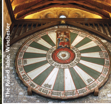
The Round Table, Winchester