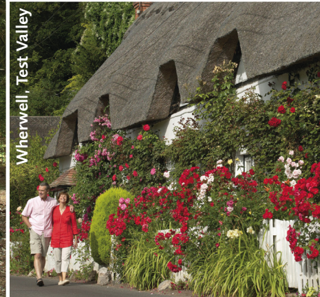
Wherwell, Test Valley