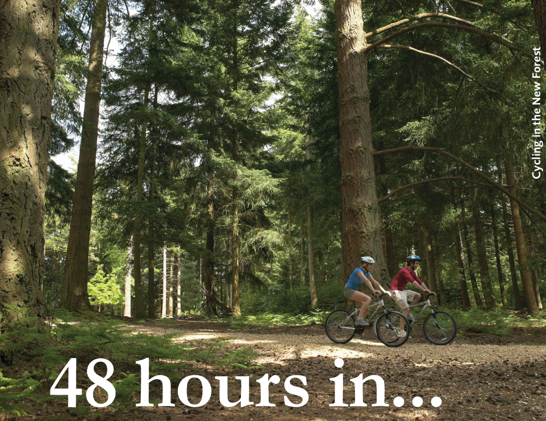
Cycling in the New Forest