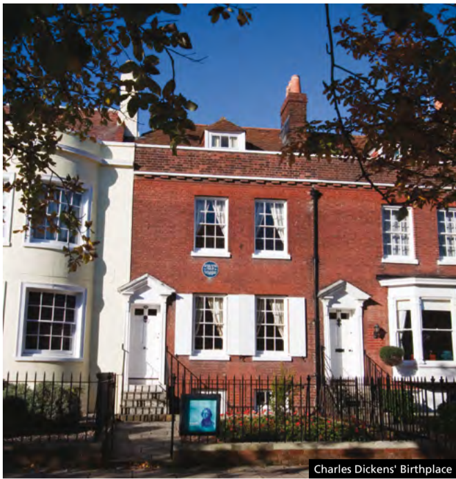
Charles Dickens' Birthplace