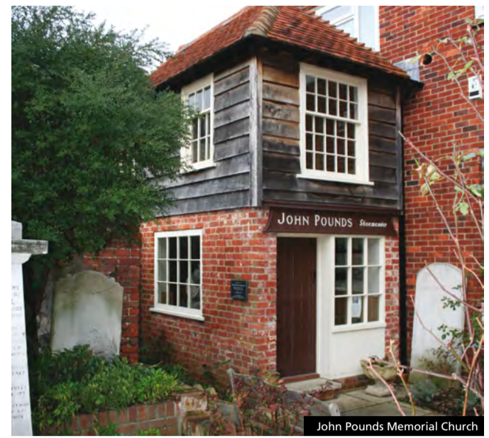
John Pounds Memorial Church