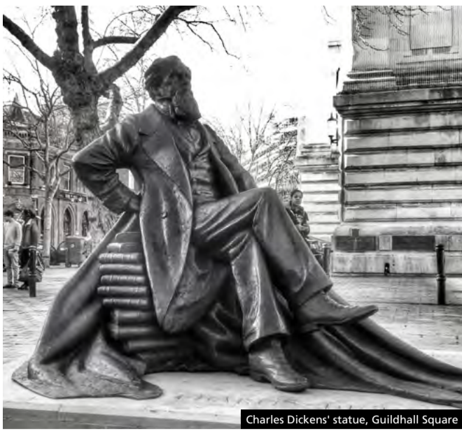
Charles Dickens' statue, Guildhall Square