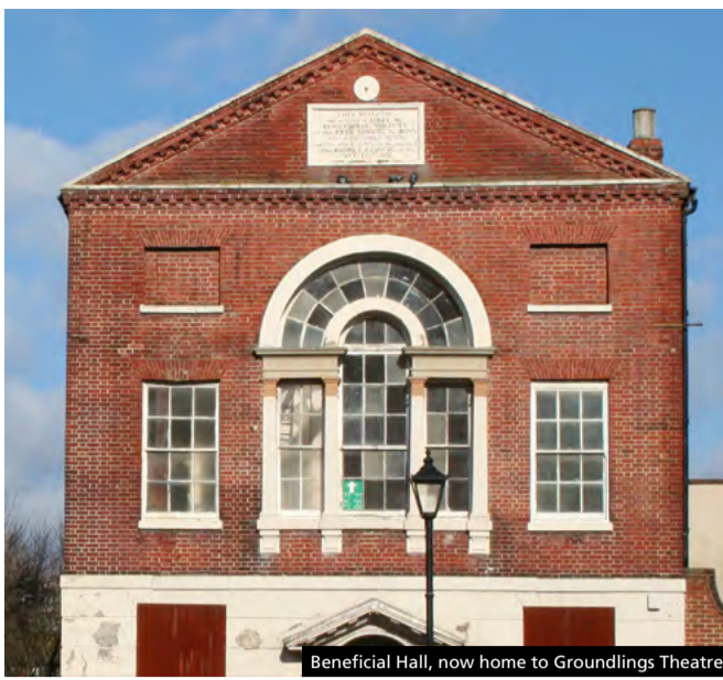
Beneficial Hall, now home to Groundlings Theatre